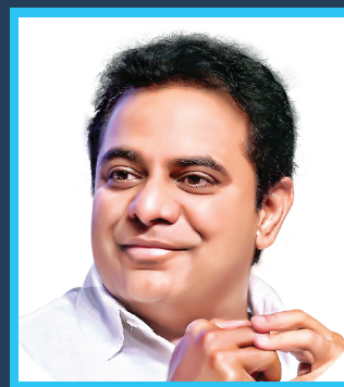
KT RAMA RAO

Hon'ble Minister for IT, MA&UD, Industries, Mines and NRI Affairs Government of Telangana