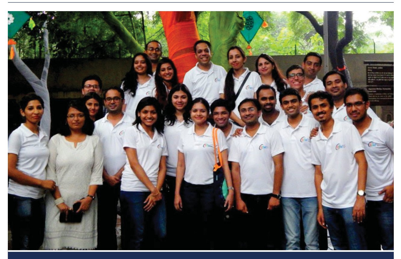
The CEEW team in November 2015. (CEEW)