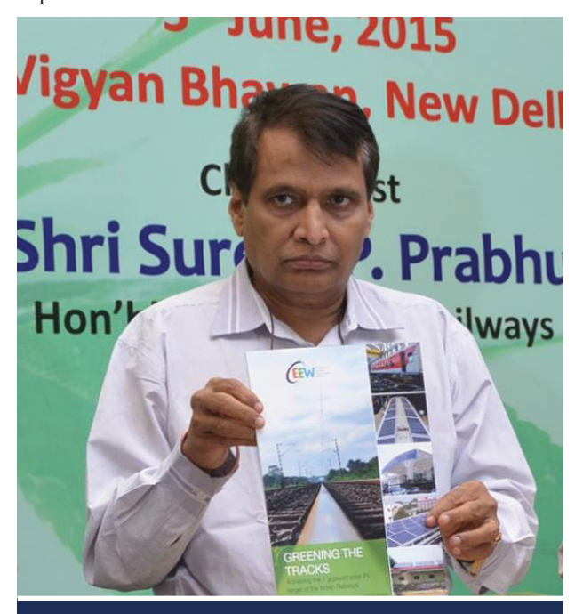
Minister of Railways and CEEW board member Suresh Prabhu releases a policy briefing on the solar potential of Indian railways.