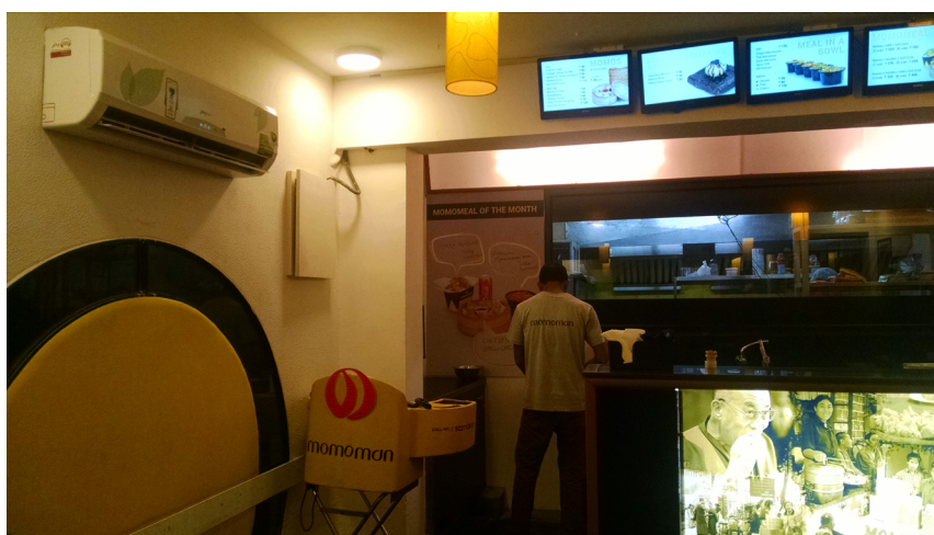
Hydrocarbon AC in use at a commercial establishment in Gujarat

India is prone to the adverse effects of climate change, including the threat of drought and floods. Specifically, India has already experienced a national increase temperature of 0.4°C, variable regional monsoons, and sea level rise of 1.06-1.75 mm per year. 29 The Intergovernmental Panel on Climate Change (IPCC) has predicted with virtual certainty that frequent hot temperature extremes will be one of the many impacts of increased global temperature. 30 This means India very likely will experience amplified and extended heat waves. This increase in temperature will only exacerbate use of room ACs, 31 causing a continual feedback loop of increased temperature, increased AC use, and so forth. In addition, not only will extended heat waves have adverse health effects on India's most vulnerable population, but they will also affect food security and potentially displace large numbers of people living along India's vulnerable riverfronts and coastline.